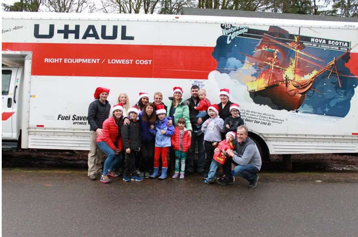
This 26' U-Haul Truck was filled completely with toys!