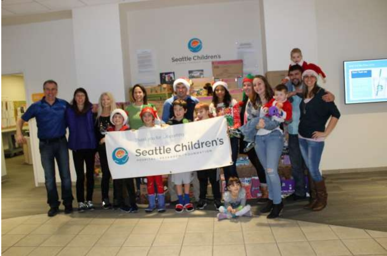
The amazing team of volunteers that delivered 5890 toys to the hospitals